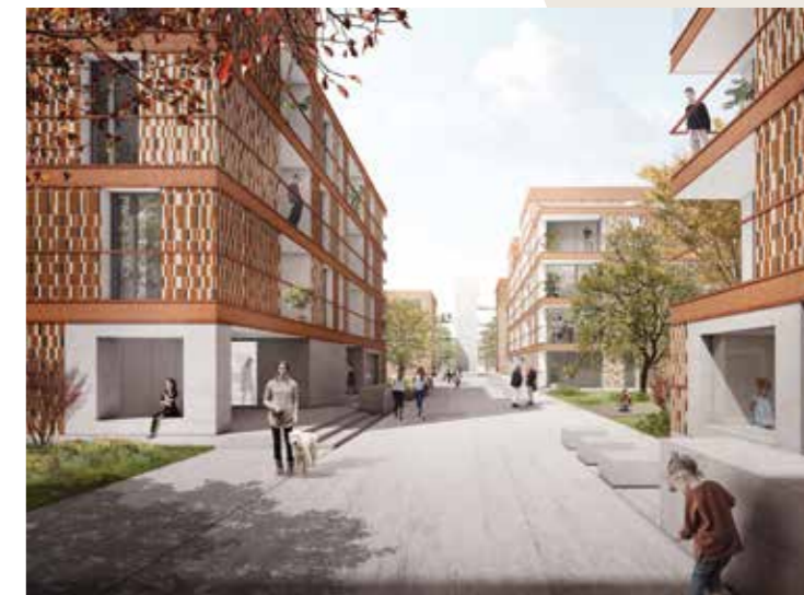
The Novo Brdo (New Brdo) neighbourhood, Dekleva Gregorič architects