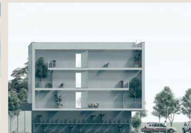
The neighbourhood Skupnost za mlade Gerbičeva (Community for Young People, Gerbičeva), idea design by Protim Ržišnik Perc