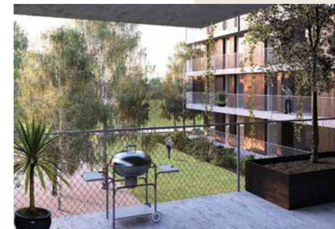
Ob Savi (By Sava) neighbourhood