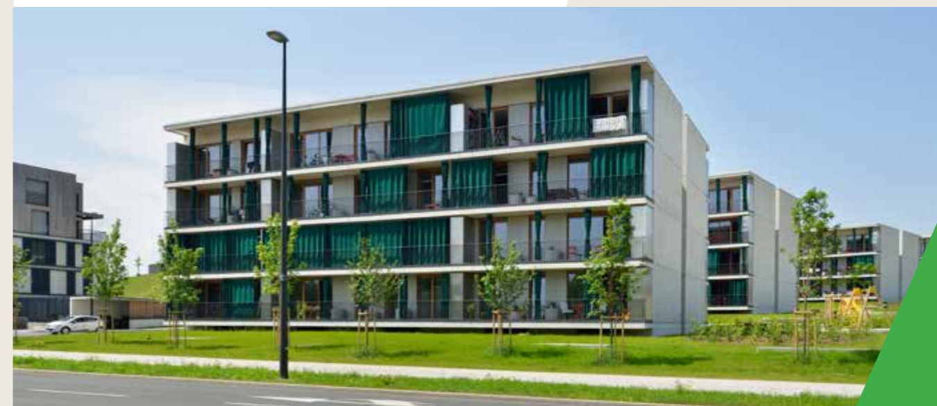
Zeleni gaj (Green Grove) neighbourhood, F2, Bevk Perović architects