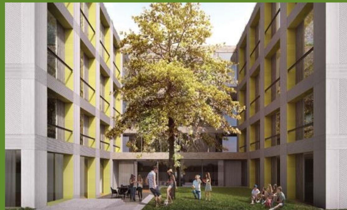
Community for Young Gerbičeva, LJUBLJANA 110 residential units 2019-2020