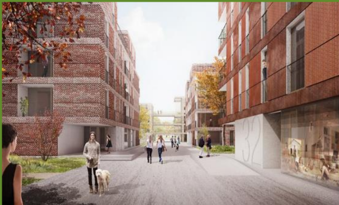
NOVO BRDO, LJUBLJANA 498 residential units 2018-2020